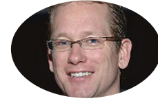
Dr. Nick Nurse: Head Coach of the Philadelphia 76ers