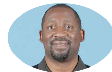
Dr. Adrian Griffin: Head Coach of the Milwaukee Bucks